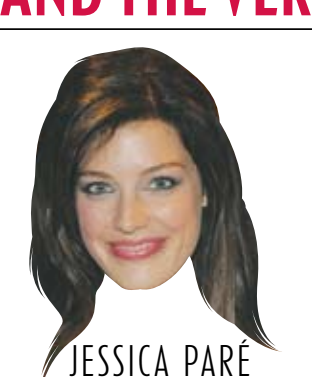
Not sure about her stenography skills in real life, but this much is true: This actress drives many men mad!