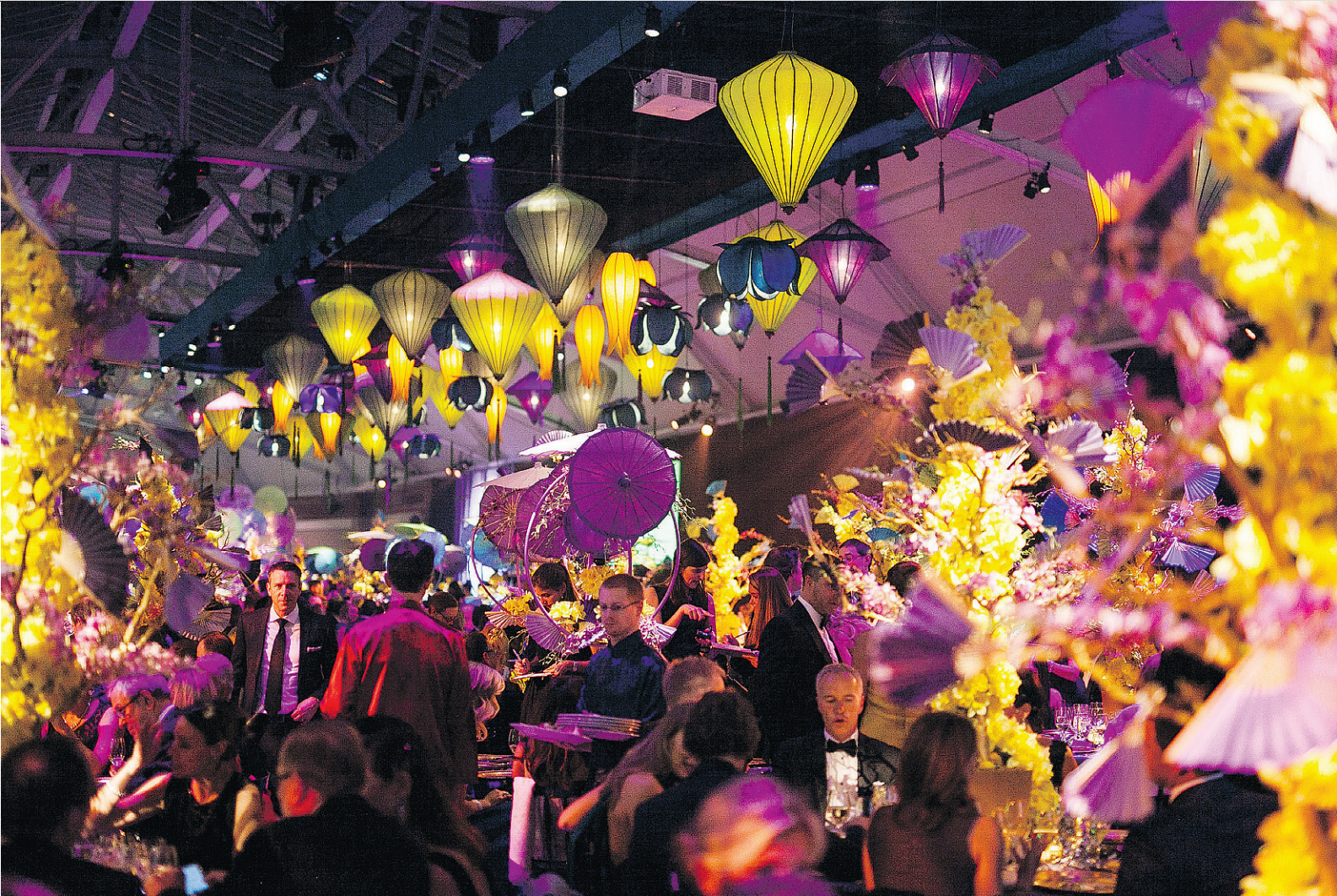
Next Level decor: The Shanghai Silk theme wows at the Annual Daffodil Ball benefiting the Canadian Cancer Society.