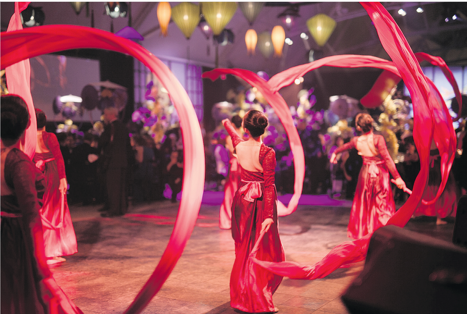
PHOENIX SO FAB Phoenix HuaYun Artistic Troop wows at the 2015 Daffodil Ball.

The pinnacle of fine dining: As for the dinner itself served flawlessly by wait staff garbed in authentic midnight blue silk tunics on stunning Chinese dishes (specially imported from China by Sofa To Go), it was a themed five-course